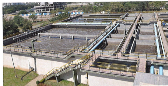
SBR Unit at 40 MLD STP at Kharadi, Pune