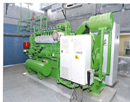
600 KWe Capacity Bio Gas Power Plant at 84 MLD STP, Variav for SMC, Surat