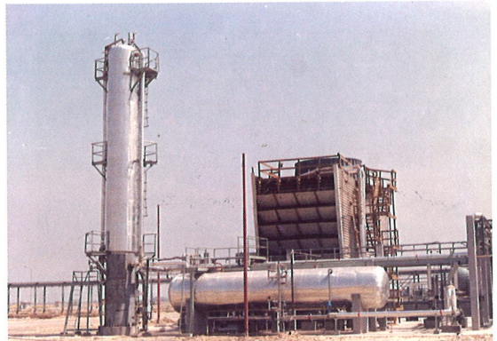
Effluent Treatment Plant for IFFCO-Aonla