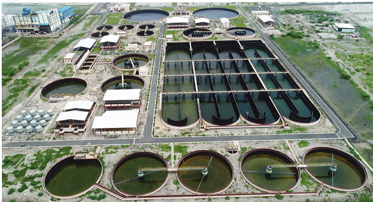
40 MLD CETP at Dahej for Gujarat Industrial Development Corporation