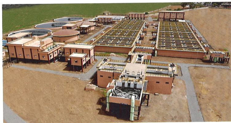
84 MLD Two Stage Biological (UASB + MBBR) STP at Variav for Surat Municipal Corporation