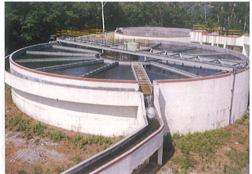
40 MLD WTP, Curti-Ponda , PWD, Goa