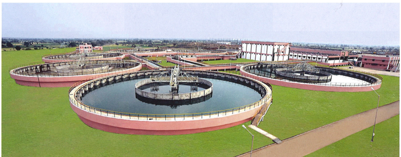
363 MLD, WTP at Baklai for Indore Municipal Corporation