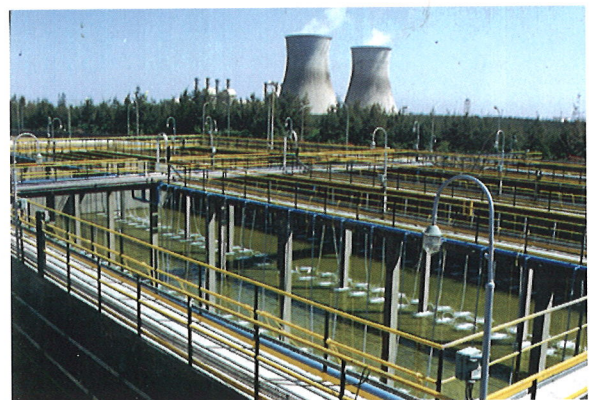
Diffused Aeration based Effluent Treatment Plant including Tertiary Treatment for reuse of waste water for Reliance, Hazira