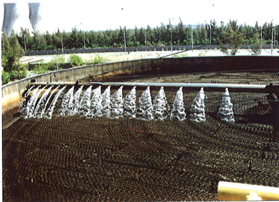
Bio-Tower Installation for Effluent Treatment Plant, RELIANCE, Hazira