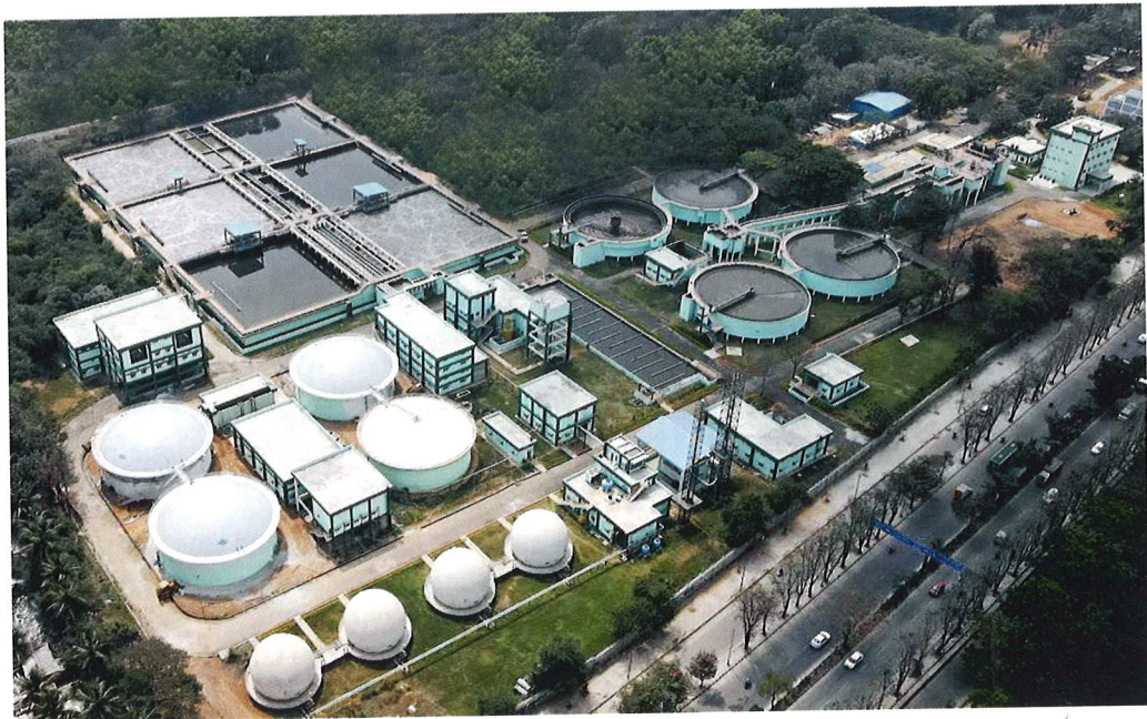
India's First Largest 100 MLD capacity STP with Primary Clarifiers followed by SBR with 160 MLD Advance Sludge Treatment including Power Generation at Hebbal for BWSSB, Bengaluru.