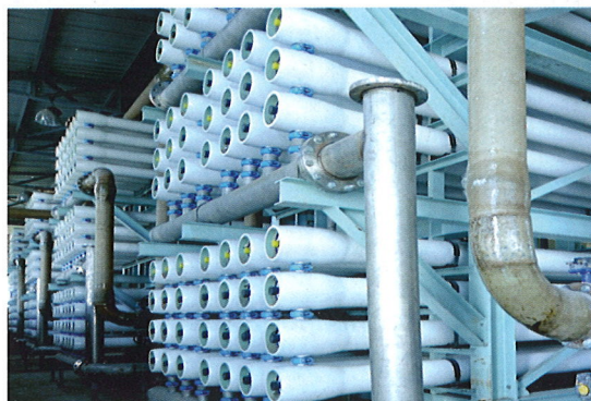
Reverse Osmosis System