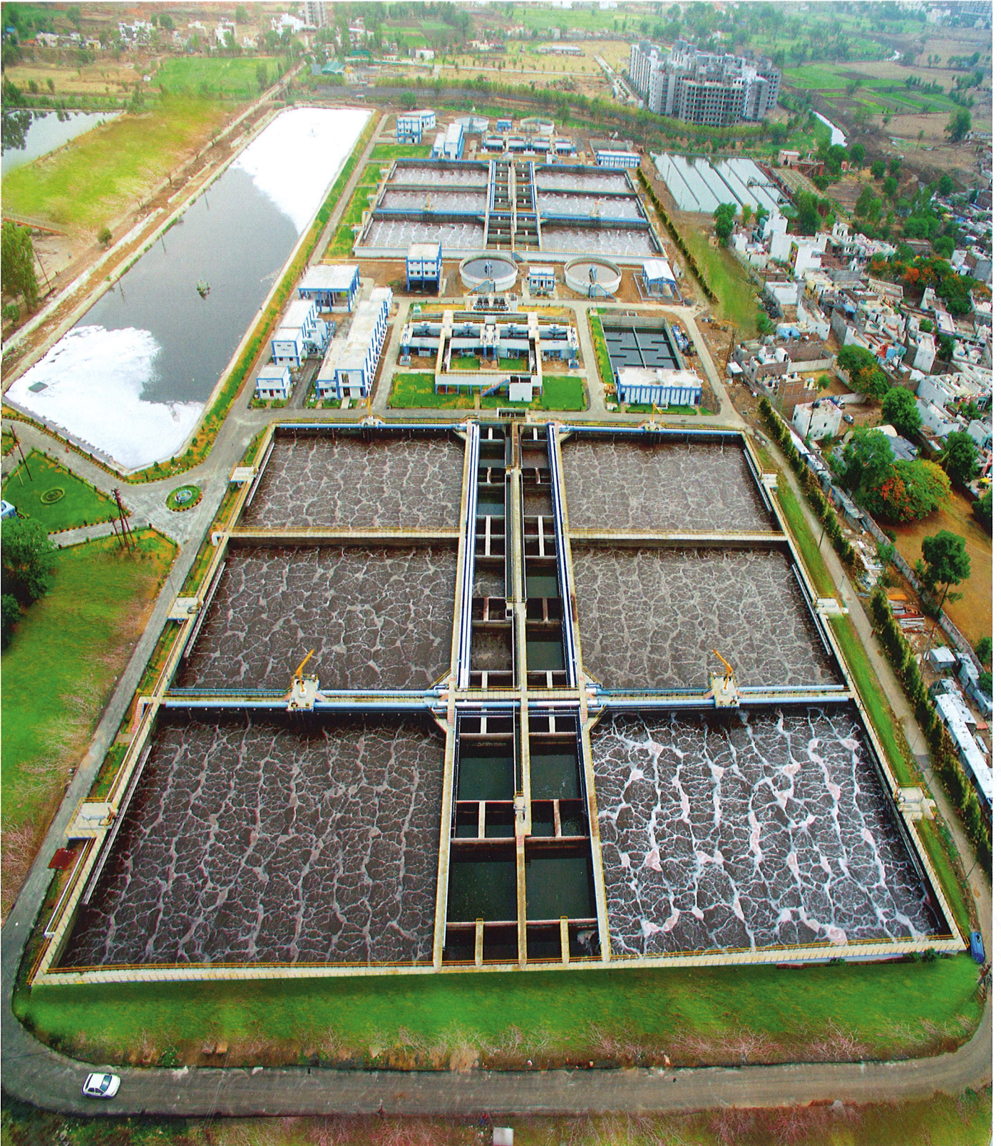
245 MLD STP for Indore Municipal Corporation, World's First Largest Single Stage Biological SBR Based STP