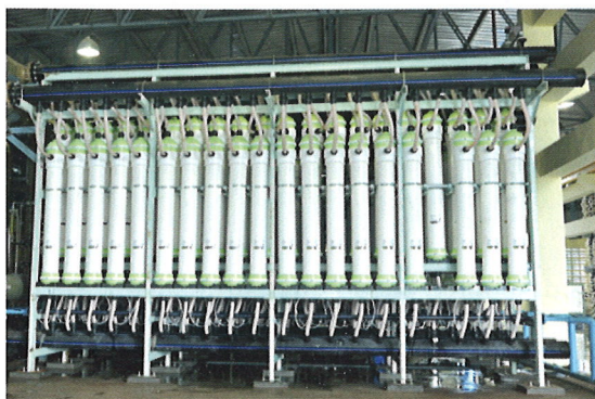
Ultra Filtration System