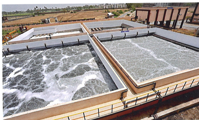
MBBR Unit at 84 MLD STP, Variav for Surat Municipal Corporation