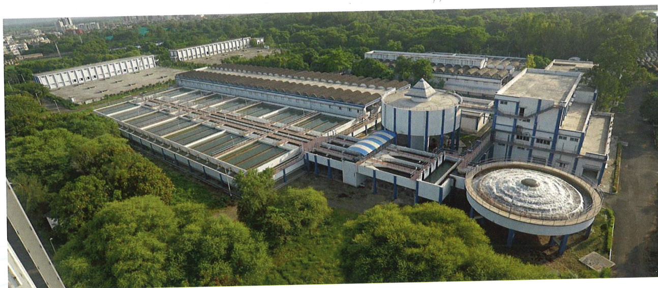
200 MLD WTP at Sarthana for Surat Municipal Corporation