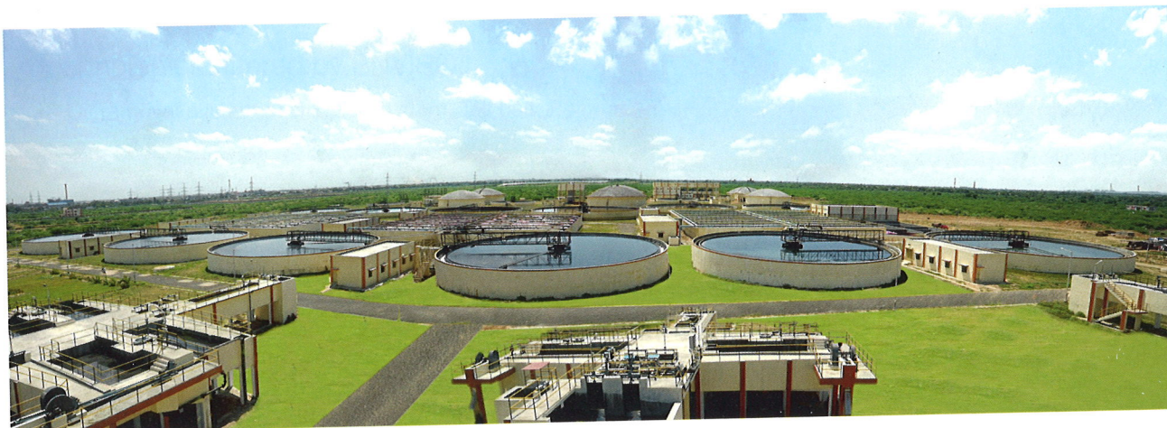
180 MLD STP, Pirana, Municipal Corporation, Ahmedabad India's First Largest STP with Diffused Aeration and PLC - SCADA System